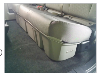
This is how the DU-HA should look installed under the back seat.