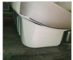
This is how the DU-HA should look installed under the back seat.